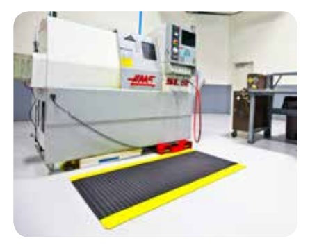
Unless a flooring system was selected to specifically provide impact resistance, applying rubber mats in areas subjected to impact will reduce costly repairs.