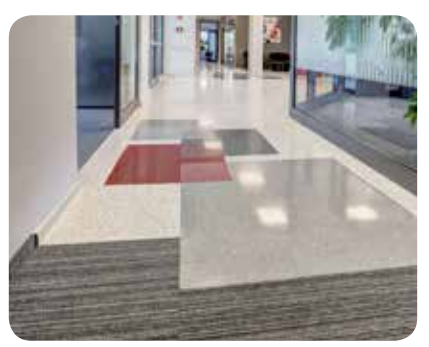
Entrance matting is designed to stop dirt at the door and keep your floors clean.